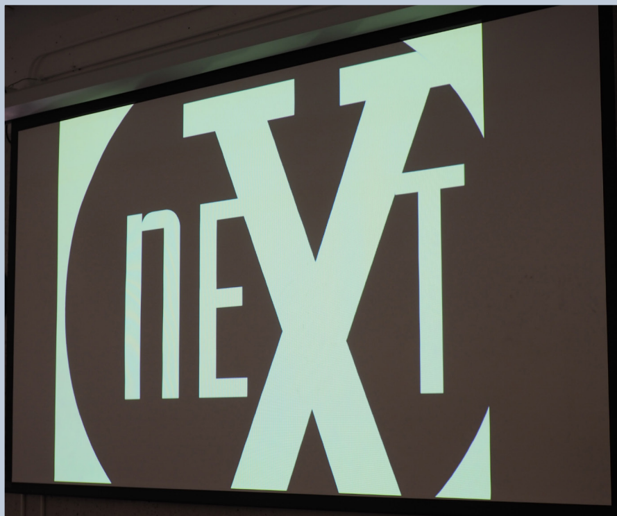
Next Decade workshop logo displayed on opening day

And it worked, we think: Scientists in every field listened to talks by scientists in just about every other field.