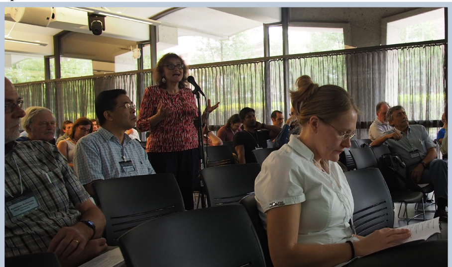
Next Decade workshop attendees discussing the future of the Chandra X-ray Observatory.

To mix things up a bit, we had decided to try and arrange talks more along physics-based lines rather than topic based. Hence your dismay when your talk on Chandra observations of clusters of galaxies was bookended by talks on stellar coronae. The flimsy excuse was that both were observations of what are essentially optically-thin plasmas.